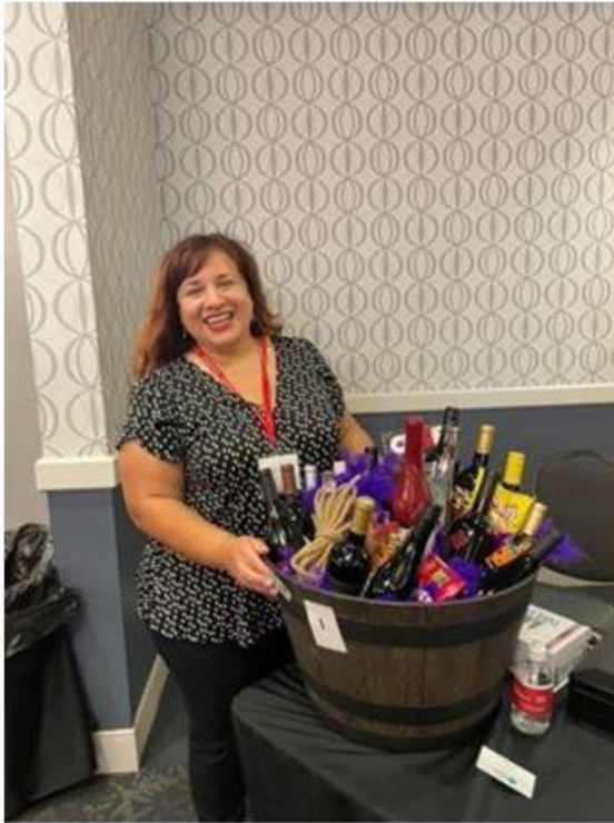
Wine Barrel Winner |