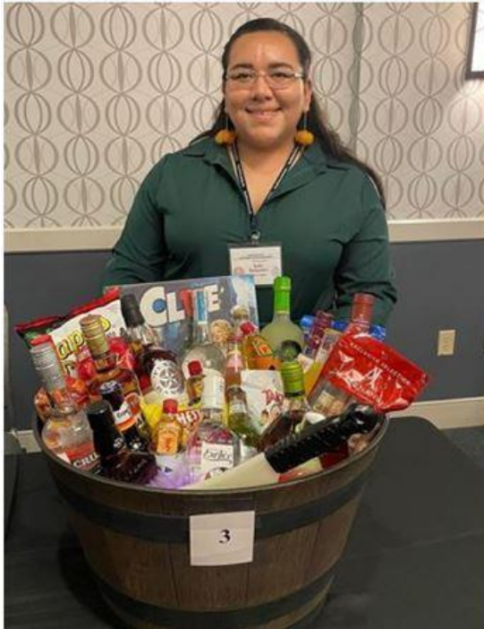
Liquor Barrel Winner.