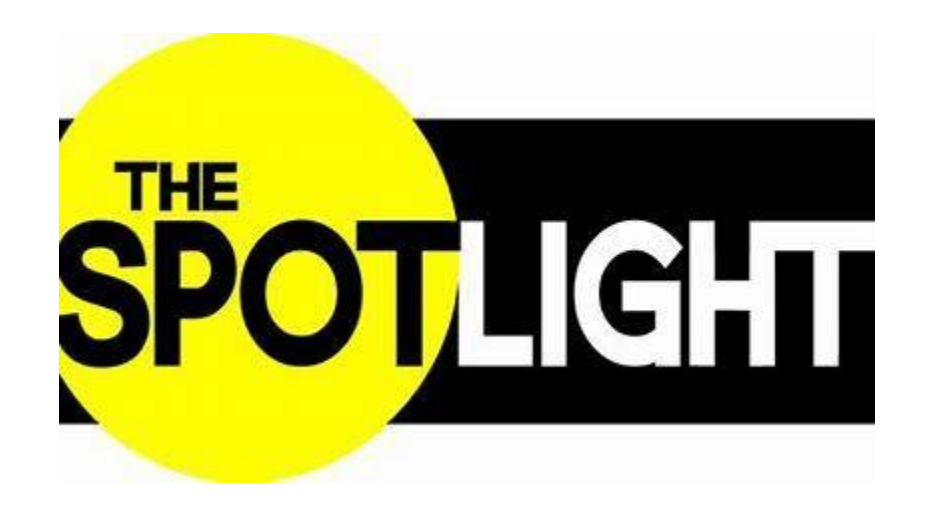
TxMLC In our February 2022 Newsletter